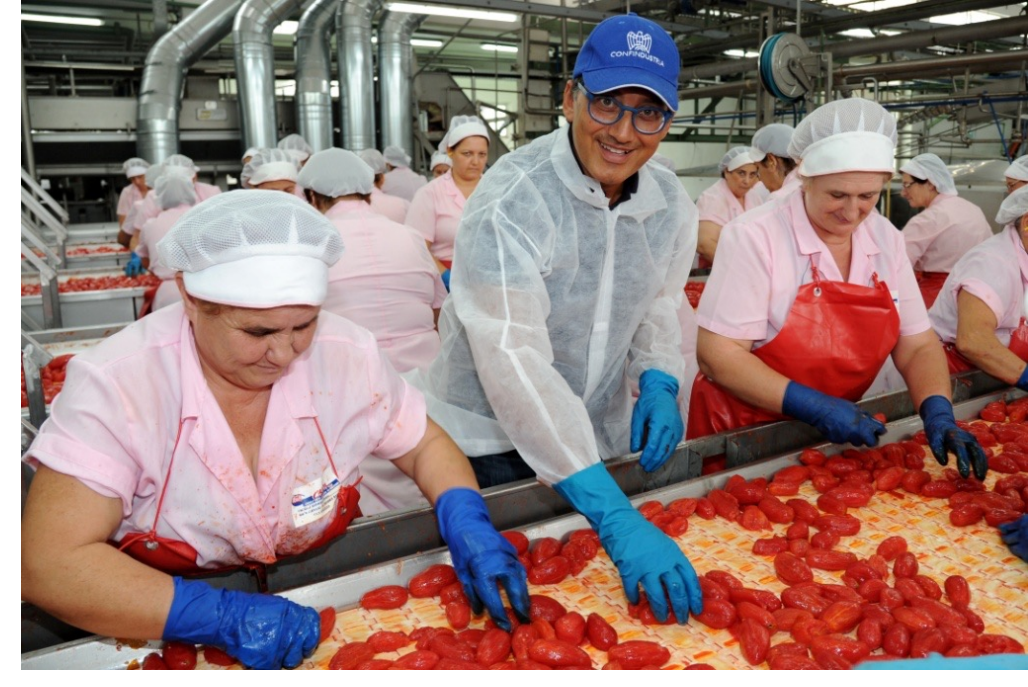
European and Italian canned tomatoes have unique characteristics: Superior taste, consistency, versatility, sustainable production methods... Of course, they are free of preservatives.