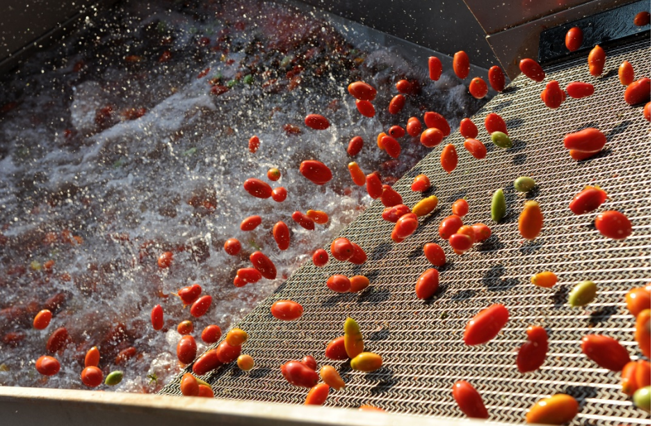
Coming home to be preserved for your table all year long.