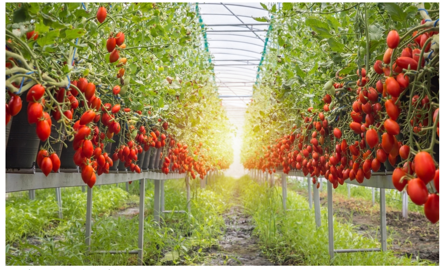
Growing for your pleasure in the sunny fields

ANICAV, the National Association of Canned Vegetable Industries invites you to enjoy Red Gold from Europe!